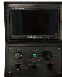
VIDEO SCREEN AND JOY-STICK BOX (driving, brush rotation direction change, lights and camera controls)