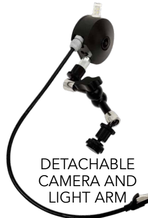
DETACHABLE CAMERA AND LIGHT ARM