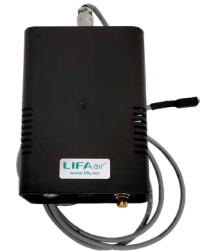
VIDEO CAPTURING DEVICE (for digital recording)