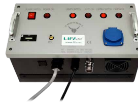
MAIN CONTROLS BOX