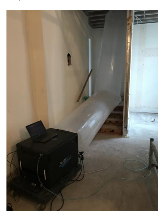
Aeroseal Injection Equipment

Objective: Reduce ductwork leakage in accordance with DW143 for Class B